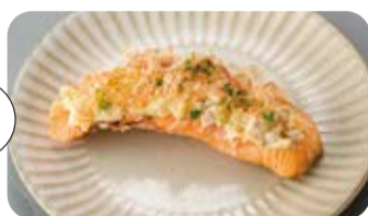
Oven baked Salmon with Mayonaise sauce