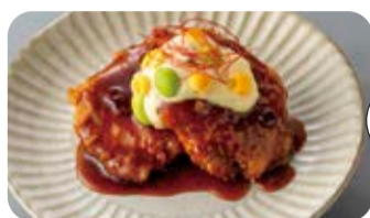
Non-Fried Chicken with Tartar Sauce